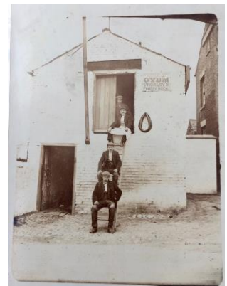
Is this Broughton?

Mystery photo in e-news edition 5 was of Broughton in Furness in Cumbria.