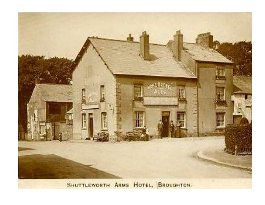
Then and now circa 1900