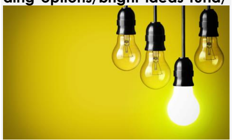
Page 2 of 2

http://mycommunity.org.uk/funding-options/bright-ideas-fund/