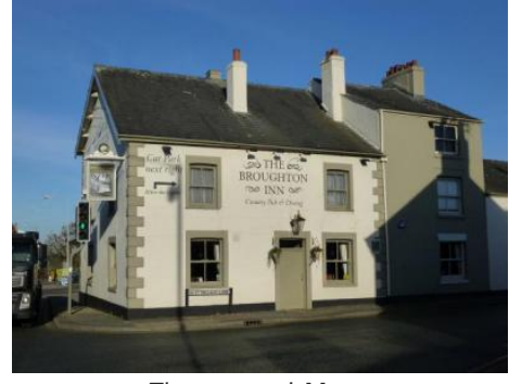
Then and Now See over-page for older image

https://www.youtube.com/watch?v=AR4BK0stPCE&feature=youtu.be